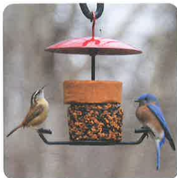
Hot Pepper Stackables® Carolina Wren & Eastern Bluebird