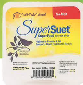
No-Melt SuperSuet Cylinder Also Available