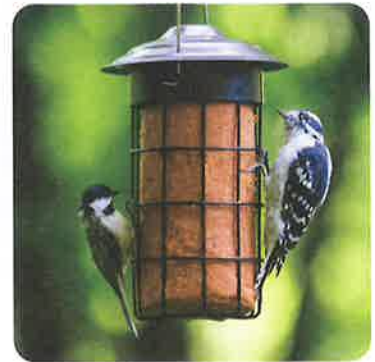
Hot Pepper No-Melt Suet Cylinder Carolina Chickadee & Downy Woodpecker