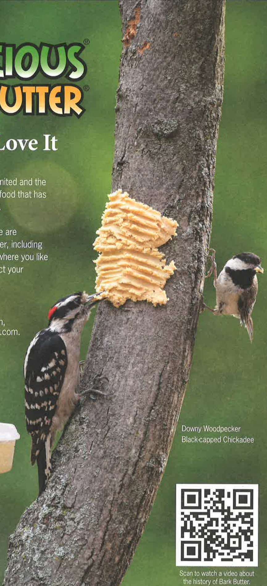
Downy Woodpecker Black-capped Chickadee

Most of our Bark Butter products are available in our original formula or with hot pepper, to help deter critters you would rather not feed.