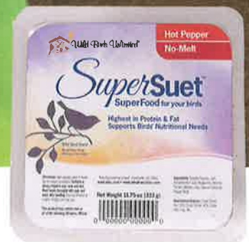
Hot Pepper No-Melt SuperSuet Cylinder Also Available