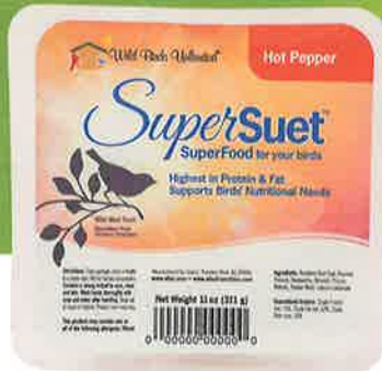
Hot Pepper SuperSuet