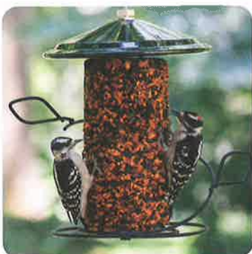
Hot Pepper Seed Cylinder Downy Woodpeckers