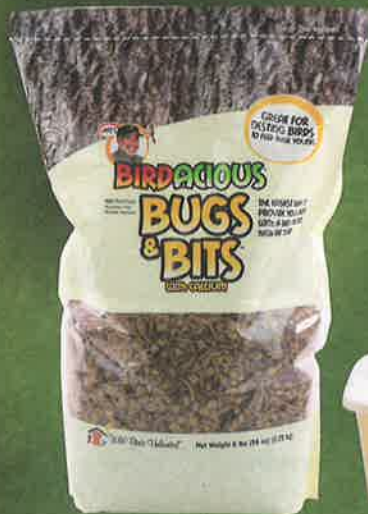
Bugs & Bits

Available only at Wild Birds Unlimited, now there are multiple ways to treat your birds with Bark Butter, including Bark Butter Bits and Bugs & Bits ® . No matter where you like to feed the birds, we have a Bark Butter product your birds will love.