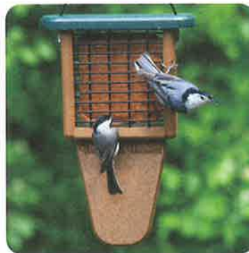
Hot Pepper Suet Cakes Carolina Chickadee & White-breasted Nuthatch