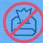
Wipes (Baby or flushable)