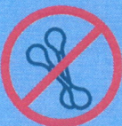
Cotton (Cotton swabs or balls)