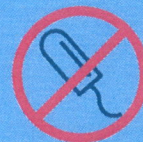
Feminine hygiene products