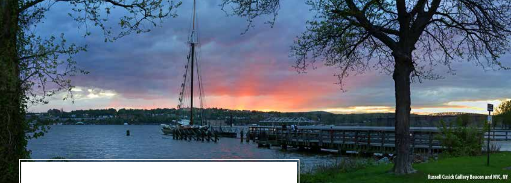
Russell Cusick Gallery Beacon and NYC, NY